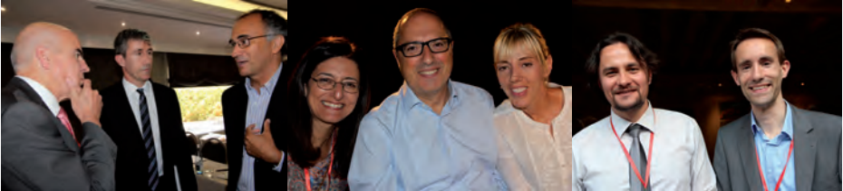
Annual General Meeting, Cyprus January 2015 & Half-Year General Meeting, Barcelona June 2015